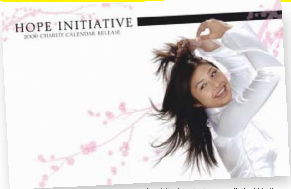
Hope Initiative calendars are available at hionline.org